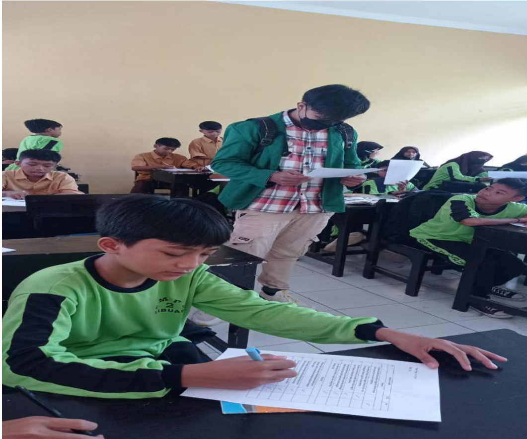
1. Distributing questionnaire