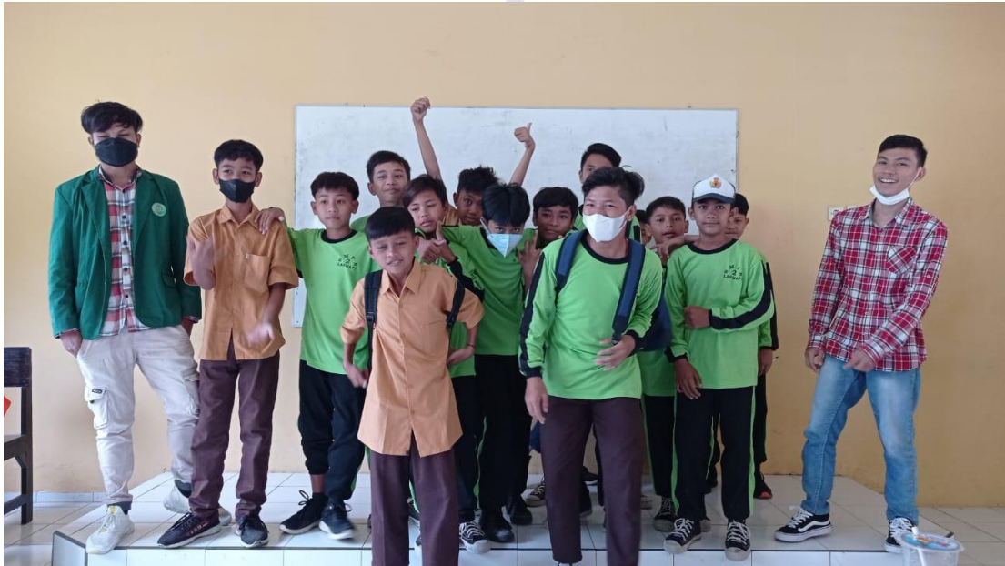
3. group foto