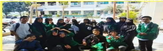
Pahad Ardi Puad English education department