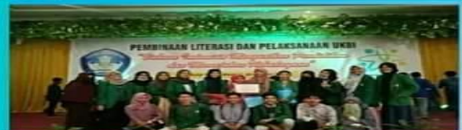
external activity (UKBI) mahasiswa prodi bahasa Inggris (FKIP) UMMAT

#Akreditasi B # info tlpn /wa 087860343153