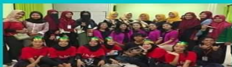
festival activity from english student association