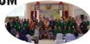
National Seminar II Indonesia with the English department