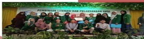
Eksternal Activity (Pembinaan Literasi)

Just Register At Home Link : http://pmb.ummat.ac.id/