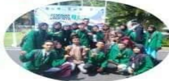
Seminar activities with the English department