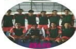
Futsal activities with the English department