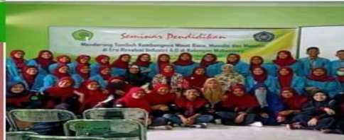
Internal activity (Educational Seminar)

Prospek Lulusan PBI • Guru • Peneliti • Jurnalis • Penerjemah • Entrepreneur