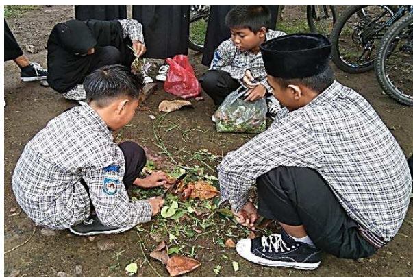
(a) Process of making organic fertilizer

This activity aimed to make solid and liquid compose. Solid compose was made from vegetable waste and rice waste. Whereas liquid compose was made from rice wash leftover. The product made by the students was as shown in Figure 2.