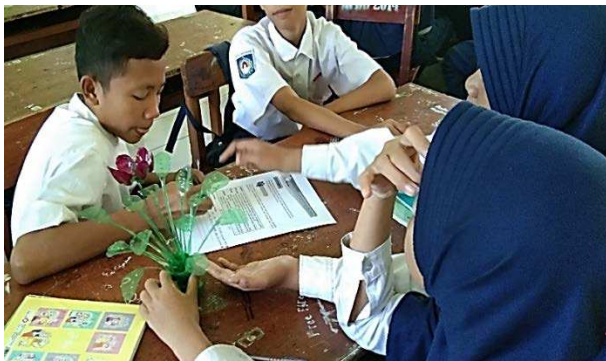
(a) Process in making handicraft product

This activity aimed to handle used goods into a more useful product. The students' types of products were flower vases from bottles, decorative photo frames made of sand and shells, soap baskets, decorative flowers made of paper and plastic. The example of a product made by the students was shown in Figure 3.