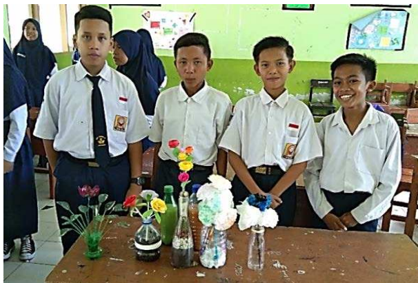
(b) Handicraft product