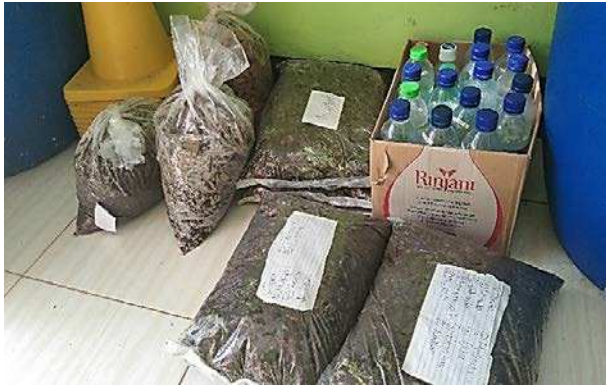
(b) Solid and liquid organic fertilizer product