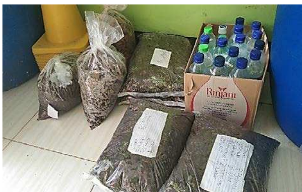
(b) Solid and liquid organic fertilizer product